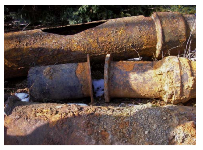
Fig. 4: Iron pipes stored in the garden of Wilhelmshöhe castle park Source: Museumslandschaft Hessen Kassel

Cast iron pipeline in operation in the Octagon UNESCO World Heritage Site – Bergpark Wilhelmshöhe Source: H. Roscher – photographed on 8 April 2010