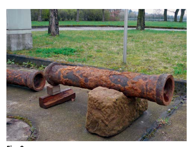
Fig. 9: Excavated cast iron pipe from the so-called Weißeritz pipe