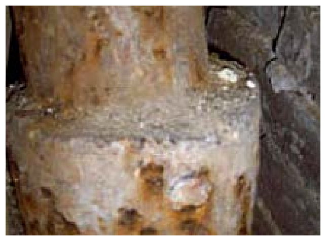
Fig. 2: The socket joint of an iron pipeline installed in the Octagon

H. Roscher was able to obtain a copy of the document shown in Fig. 5 from the archives of the European Association for Ductile Iron Pipe Systems \cdot EADIPS<sup>®</sup>/Fachgemeinschaft Guss-Rohrsysteme (FGR<sup>®</sup>) e.V. from which it can be seen that research into "old pipes" was already being conducted by the cast iron pipe industry as early as 1935. In a letter from the Prussian state building authority ( Fig. 5 ), the age of the cast iron pipes is given as more than 200 years [2].