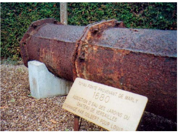
Fig. 8: Cast iron pipe from the Palace ground of Versailles